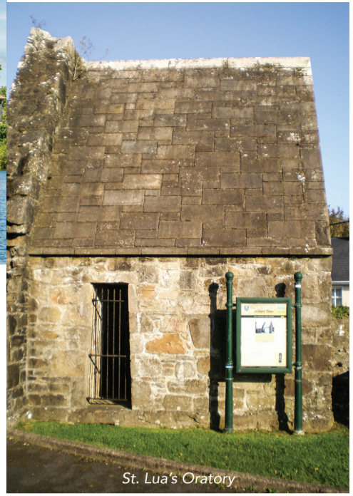
St. Lua's Oratory

The towns of Killaloe and Ballina are amongst Ireland's most picturesque settings on the banks of the River Shannon. An ancient stone bridge joins the two towns while also joining the counties of Clare and Tipperary.