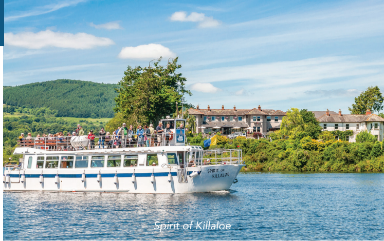
Spirit of Killaloe

Killaloe River Cruises provide tours of the River Shannon and Lough Derg. A commentary is provided on all interesting sites as you cruise by. Relax and unwind taking in the breath-taking scenery along the iconic River Shannon nestled in Ireland's Hidden Heartlands.