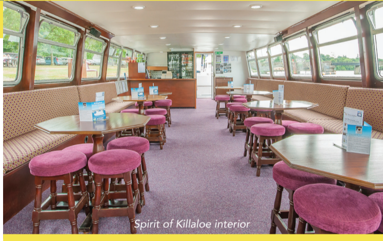
Spirit of Killaloe interior

We sail everyday from March 1 st to November 1 st . Our full up to date schedule is available on our website when you click on "Book Now" .